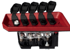
PUMP MODULE MODULE* SKU: ACC-G7EXO-PUMP