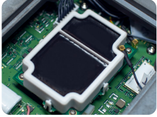
G7 EXO SATELLITE MODULE* SKU: ACC-G7EXO-SAT