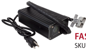
FAST BATTERY CHARGER SKU: ACC-G7EXO-FAST-CHARGER-NA